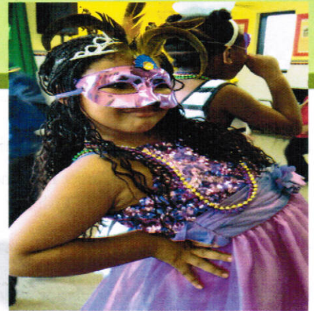
Dallas celebrates Mardi Gras in style

current events and how those events affect us as individuals and as a whole. If you have accomplishments that you are proud of, please submit them in writing by the 15 th of each month in order to be considered for the following months newsletter.